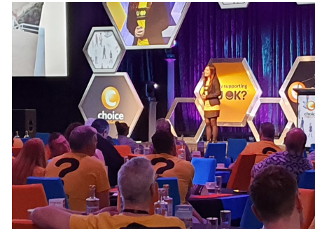
Speaking at the Choice National Conference on RU OK? Day.

100 LUNCHES WITH STRANGERS STRANGERS NO MORE